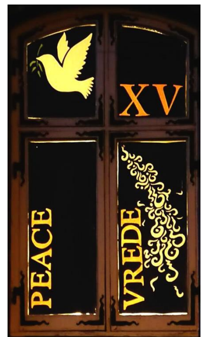
Painted acrylic sheets