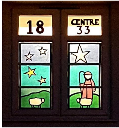
Coloured greaseproof paper