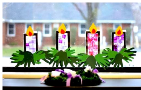
Cellophane and tissue paper