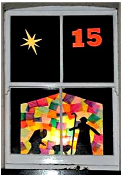
Coloured tissue paper