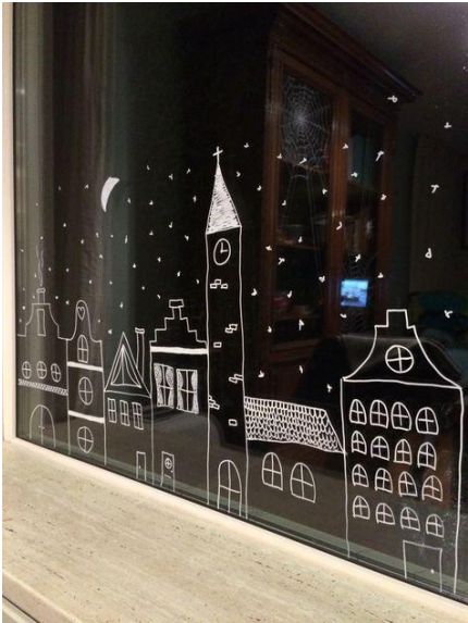
Chalk or white board marker